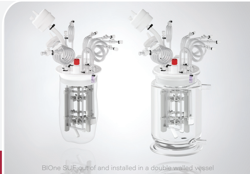
BIOne SUF out of and installed in a double walled vessel