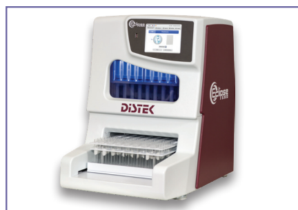
Eclipse 5300 without Filter Changer