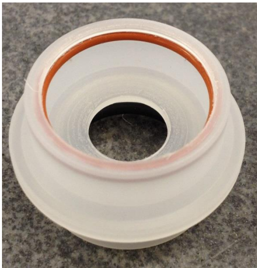
2100, 6100 and 6300 Basket Access Cap Side